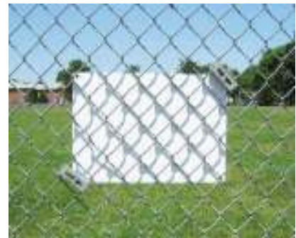
Figs. 4 & 5: Two sides of the coin.

captured movable nut inside the Sign Guardian using a standard flat-blade screwdriver. Level the sign and then tighten down the bolts. A special bolt removal screwdriver bit is needed to unscrew the bolts, shown in Fig. 3.