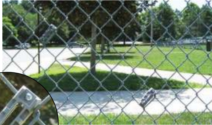
Fig. 1: The Sign Guardian clips to a standard chain-link fence, as shown at left.

Installation is simple. Slide the Sign Guardian(s) onto the fence and tighten the set screw(s) as shown in Fig. 2. Then mount the sign using the supplied tamper-resistant bolt. It screws into the